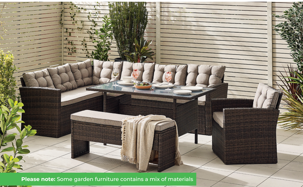
Please note: Some garden furniture contains a mix of materials

Polywood is durable and practical but is ultimately made of plastic and therefore, in cases of extreme heat, or when glasses can focus sunlight, melting can occur, as this can increase the heat. For this reason, we advise that coasters are always used on polywood surfaces and that you are mindful of any sunlight spots on your tabletops.